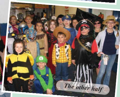
The other half