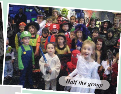
Half the group