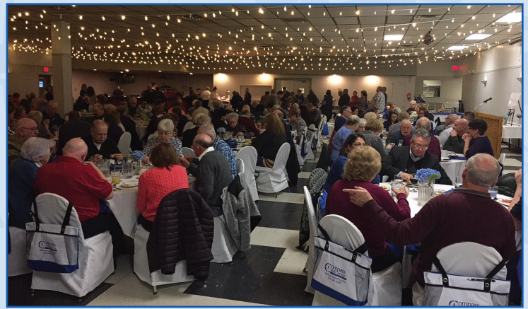
Compass' 52nd Annual Meeting Celebration at the Oswego Elks Club

Thank you to all the members, staff and volunteers for another successful year!