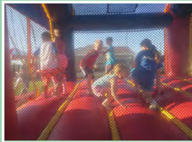
Above: Children enjoy the bounce house at our community picnic.

Afterward, Compass extended a huge thanks to all of the volunteers, staff and vendors who worked hard to make the event a success.