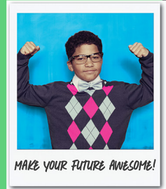
MAKE YOUR FUTURE AWESOME!