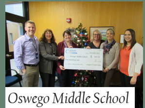
Oswego Middle School