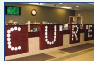
Compass lobby last year

More information about Relay for life is available at www.relayforlife.org .