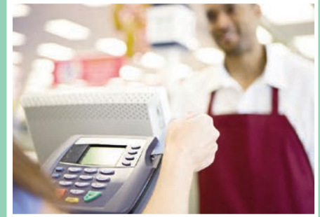
A debit card transaction that does NOT require a PIN is a signature transaction .

Please note: If a box for your PIN automatically appears when you are making a purchase, you can simply press "cancel" and instead press "credit" to complete a signature-based transaction.