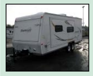
2011 Flagstaff Shamrock 23SS

For a slide show of detailed photos, please visit our web site at www.compassfcu.com.