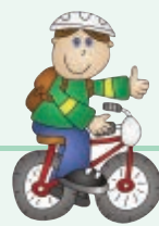
Children must be members.