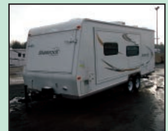
2011 Flagstaff Shamrock 23SS

If you are interested in purchasing this RV, please call Compass Manager Tom O'Toole at 342-7895. For a slide show of detailed photos, please visit our web site: www.compassfcu.com .